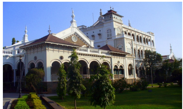
Aga Khan Palace

The Aga Khan Palace was built by Sultan Muhammed Shah Aga Khan III in Pune, India. Built in 1892, it is one of important landmarks in Indian history.