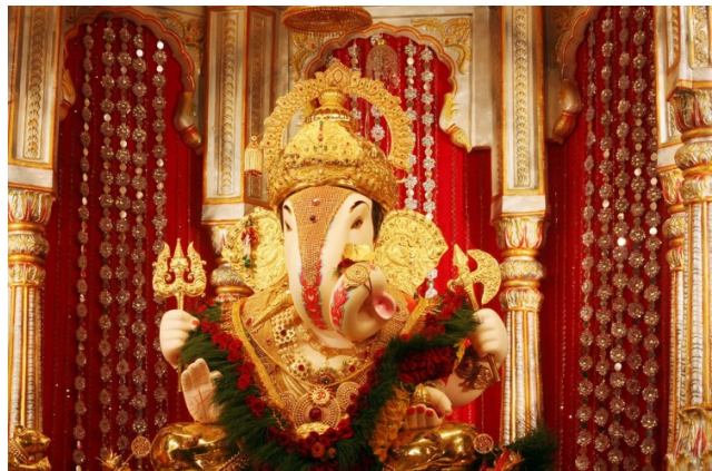
Dagaduseth Halwai Ganpati Temple